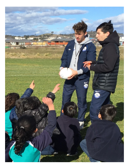
Sports Coaching & Management

Students study the roles and responsibilities of coaches and the range of coaching styles. Students become familiar with code of ethics, coaching accreditation, stages of learning, game and technique centred approach, skill development, planned coaching, activity modifications and communicating with participants.